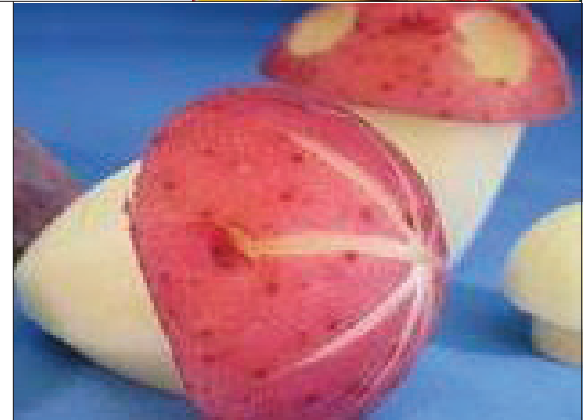
Potato Red Skin Carved Mushroom Product # KF648 • Size 75 pieces per 5 lb. case

Our all natural buffalo are free range animals from Colorado. These buffalo are finished on corn and therefore have a very mild, sweet and rich flavor. The hand selected eye of round is brined with a traditional pickling spice and is then fully cooked. The eye of round is very lean and easy to slice for service.