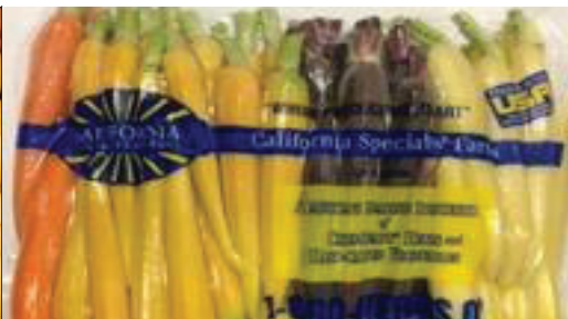
Carrot Baby Mixed Peeled 1" Top Red White Yellow Product # KG768 • Size 120 each, 5 lb. case

Fingerlings are labeled as such for their elongated shape. They are loved for their earthy flavors and skins that are thin and delicious as well. Roast whole or slice in half for preparation. Russian banana fingerlings have a very creamy texture and buttery yellow flesh. Approximately 8-10 potatoes per pound, 3" in length, and 1" in diameter.