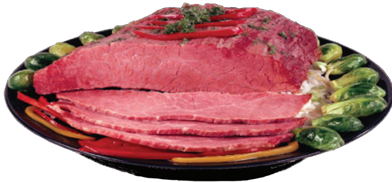
Buffalo Corned Eye Of Round Fully Cooked Unsliced Product # KA348 • Size 2 x 12 lb. per case

Add a twist to your Corned Beef and Cabbage Menu with Corned Buffalo!